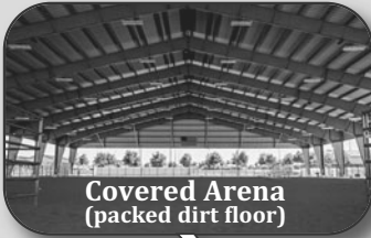
Covered Arena (packed dirt floor)